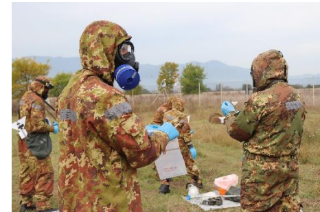
Italian NBC Defense school, Rieti, October 2018