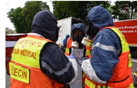
SDIS77 and ARMINES, Gurcy, May 2019